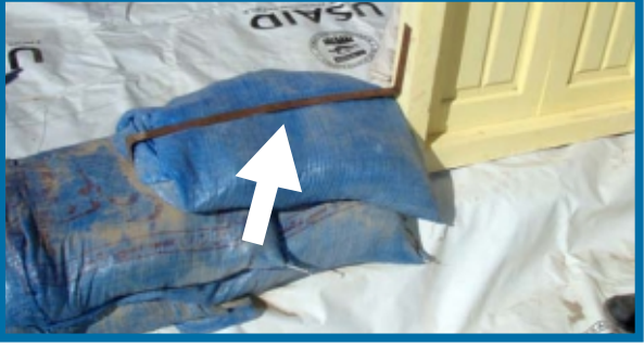
Fix the door in the wall with a steel strap.