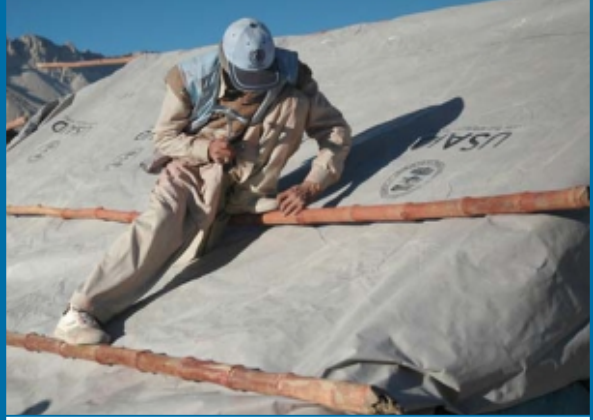
Fix 4 purlins for the CGI sheets. Sheets are 10 ft long.