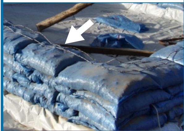
Lay barbed wire between the courses to tie the wall together.