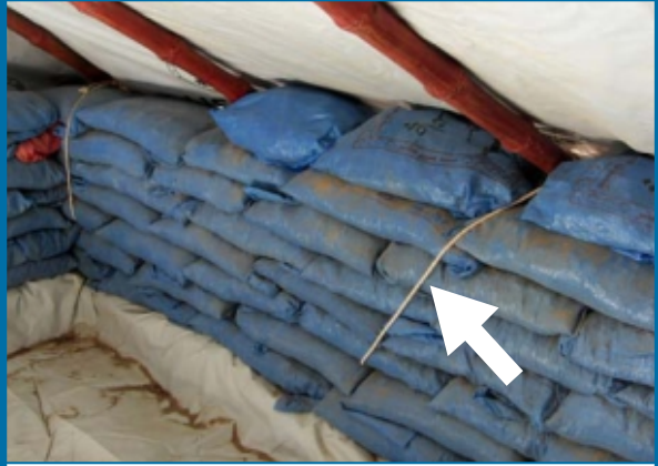
Tie down the roof with rope or wire. The wire should be laid in wall from the base.