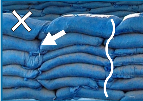
Vertical joints are dangerous. The wall may fall over.