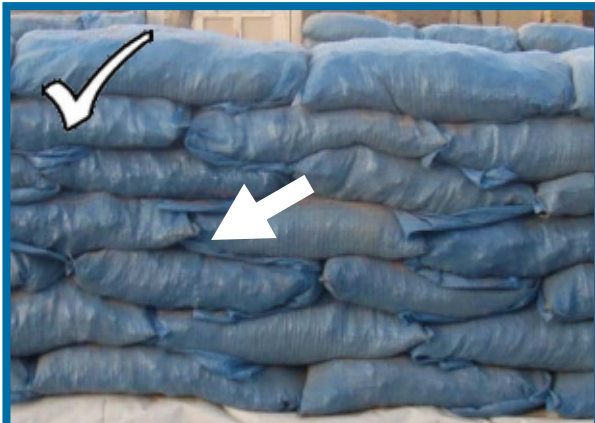
One bag should overlap the other.