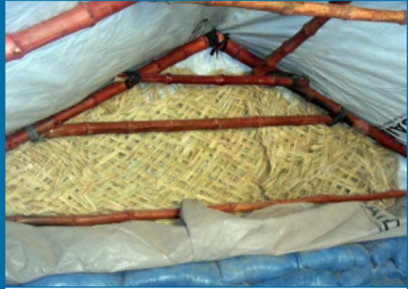
Fix shelter plastic at the gable. Insulate inside and fix another sheet of plastic.