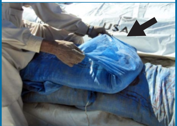
Fold over the top of the bag.