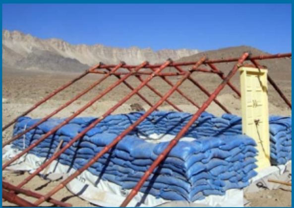
The roof is made from 6 bamboo or timber trusses.