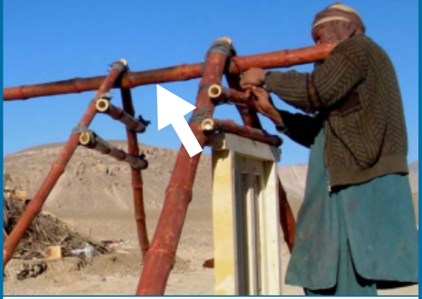
A ridge pole ties the trusses together and holds them in place