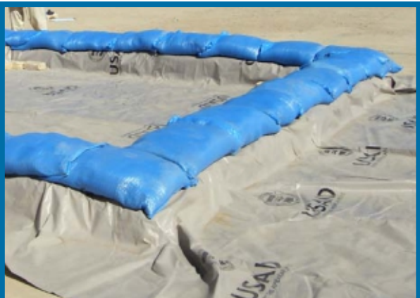
After 2 courses lay a full sheet of shelter plastic for floor.