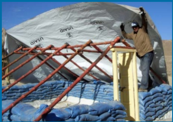
After the trusses are fixed, cover the roof with shelter plastic.