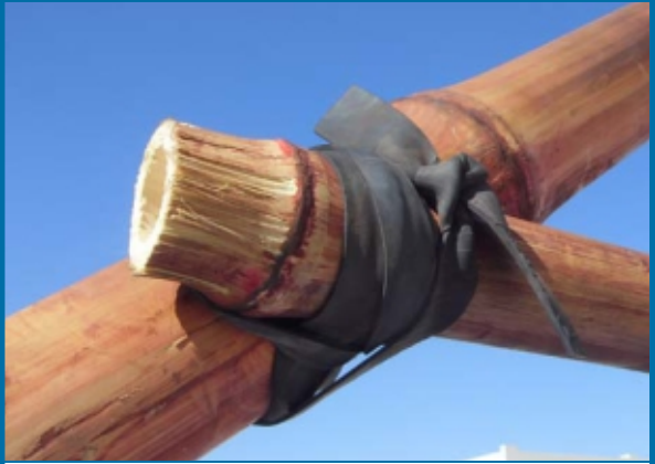
Joints should be nailed and also tied with rubber or wire.