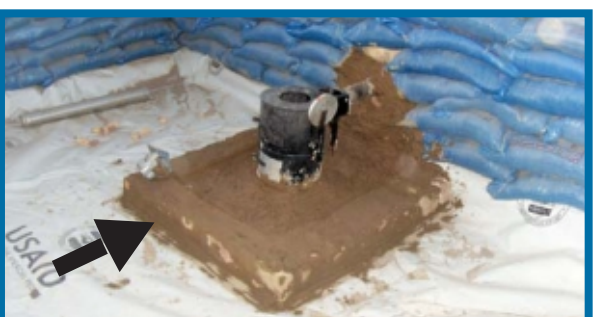
Protect a stove with a reproof surround. Take care with fire in all tents and shelters.