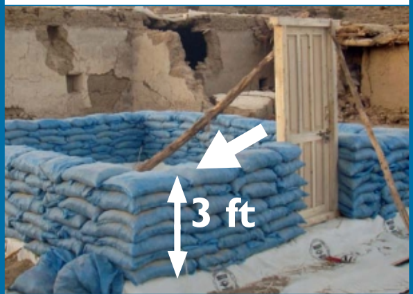
The wall should be maximum 3 feet high.