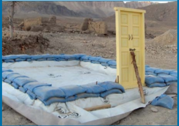
Fix the door in place so the wall can be built around it.