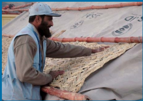
Fix kera mats or other insulation between the purlins.