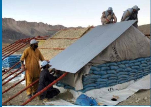
Fix CGI well against wind. Make sure roof poles are also well fixed on the ground.