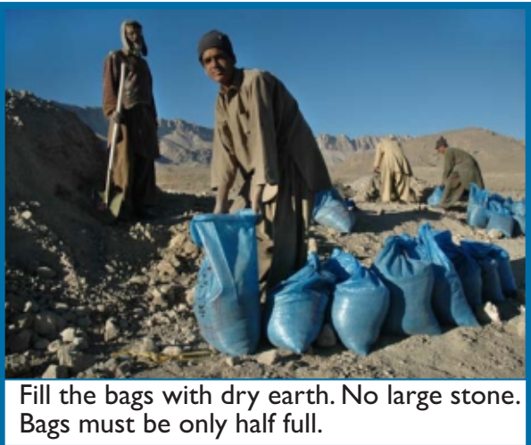
Fill the bags with dry earth. No large stone. Bags must be only half full.