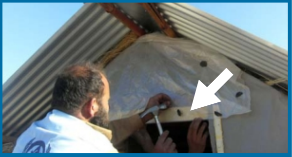
Do not nail plastic sheeting it may rip, always fold it and use a washer.