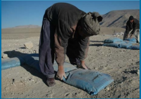
Lay the bags flat and level, with no gaps.